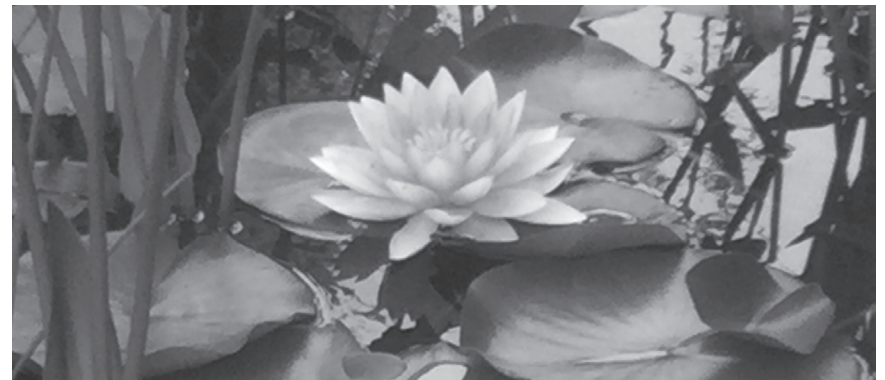
Day trip to Rideau Woodland Ramble in 2024

Our guide will lead us on a tour of the Rose Garden, the Explorers, and the Heritage Rose Garden. There's lots to see on the eight acres such as the perennial collection, rock gardens, annuals, Macoun sunken garden and memorial garden. The tropical greenhouse will be open to public as well. We can bring a picnic lunch and cross the road to the Arboretum and enjoy the walkways, mature trees and shrubs.