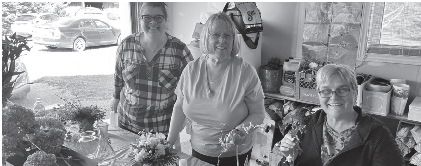
Learning loads about entering flower shows

In the morning, learn how to select, condition and present specimens for a flower show following the OHA judging standards. The afternoon will be spent learning tricks and tips for flower arranging. Bring secateurs.