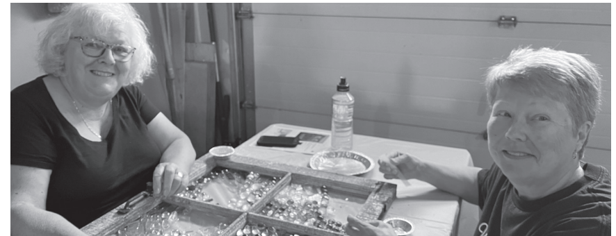
Fun at the Glass on Glass Workshop

Choice of picture frame or window, mobile or garden totem. Supplies of multicolored glass, baubles, glue, wire and glass cutters included. Bring your own totem pieces, picture frame or window (not exceeding 12' x24'), gloves, wire cutters, pliers (for mobiles).