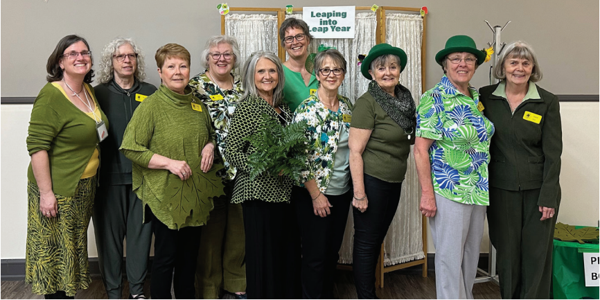
District 1 AGM