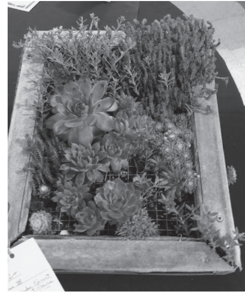
Box frame succulent garden