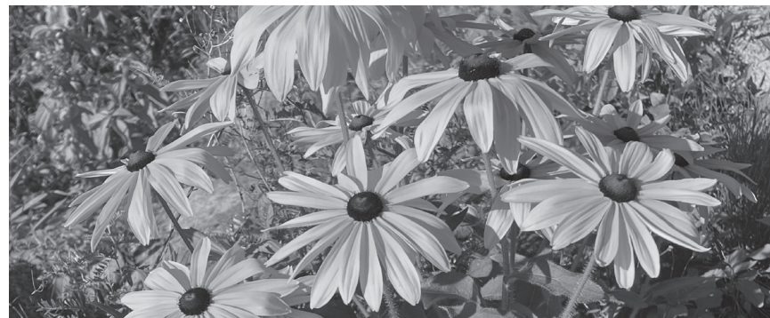
Our Society flower, rudbeckia hirta