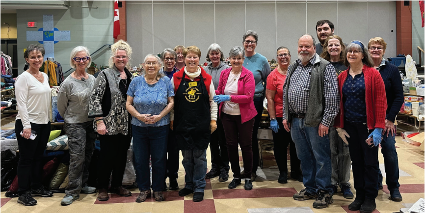
March it on Out!